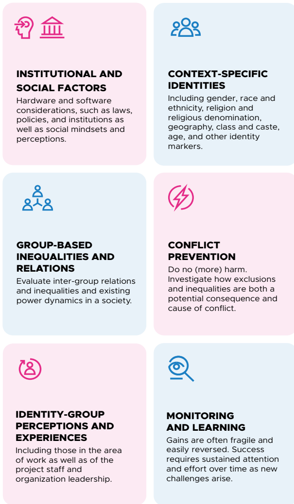
Figure 3: Pluralism assessments key components